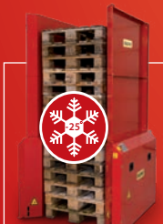
Pallet handling in cold environments down to -13 °F/ -25 °C (Only available for 15 pallet / 500 kg capacity models)