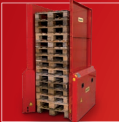
Safety frame for 15 pallets

Control: Siemens S7-1200 Actuator: Linak Power source: 100-240VAC / 50-60 Hz / 1P+N+Pe