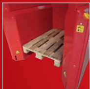
Reinforced inlet plates (+8 mm) + backplate (+1 mm)