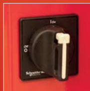
Main Isolation Switch