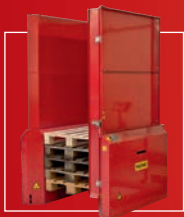
Safety frame with gate for 15 pallets